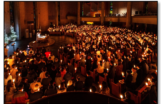
Christmas Eve Candle Service