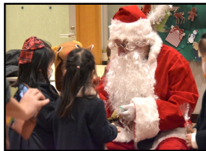
Japanese children with Santa Claus