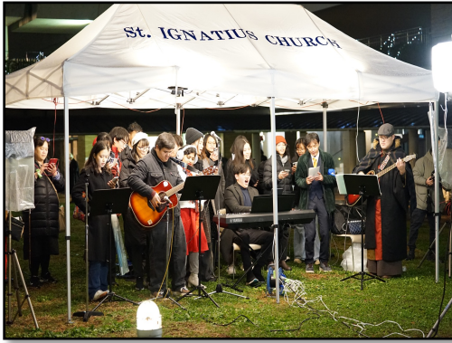
Christmas Eve Caroling by the SIIYM and Japanese Youth Groups