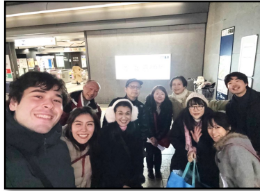
Caroling at Yotsuya station