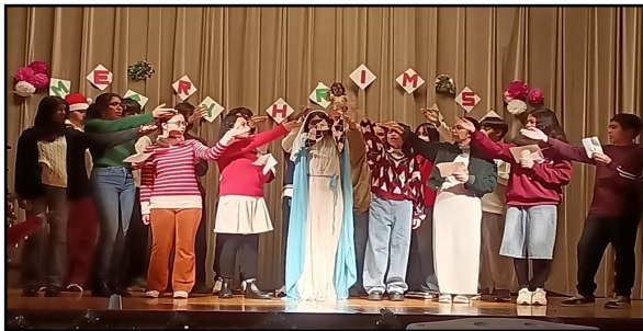
Christmas skit by Sunday School Teens