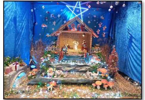
Christmas manger made by the Vietnamese Group