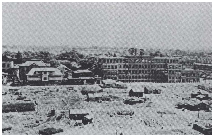
Sophia University, 1945