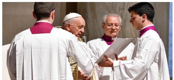
Pope reading the Papal Bull

"May the power of hope fill our days," the Pope says, "as we await with confidence the coming of the Lord Jesus Christ, to whom be praise and glory, now and forever."