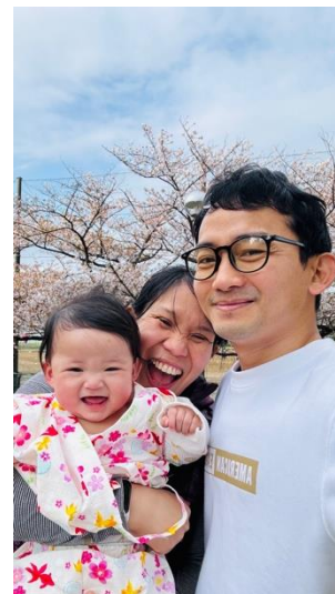
with their new bundle of joy!

As God faithfully bestowed on us the grace of co-creation, blessing us with a bundle of joy just two months after we got married, we faced new challenges. The opportunity to manifest what we have learned in the Pre-Cana again surfaced. We are reminded that evangelization begins at home. As parents and co-educators, we have to model what it is like to be a Christian - from simple things like daily prayers before and after sleeping, prayer before meals, praying the rosary and going to church together. More so, as husband and wife, we have to set an example to be more loving and kinder to each other.