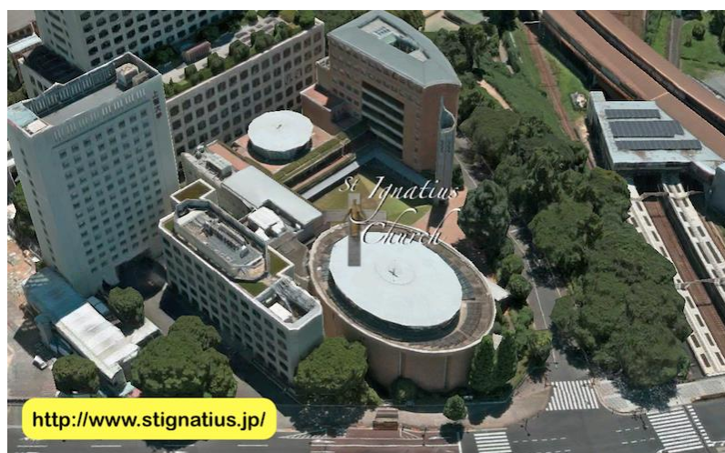
Aerial view of the present church