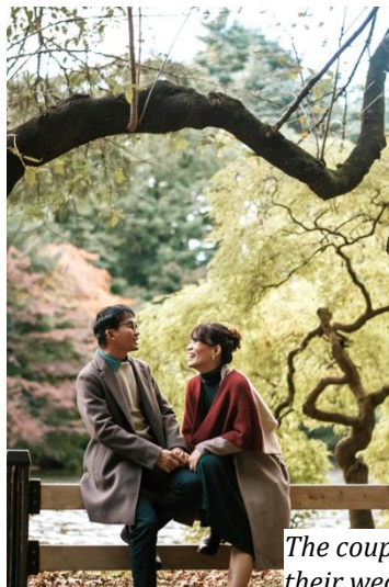
The couple before their wedding