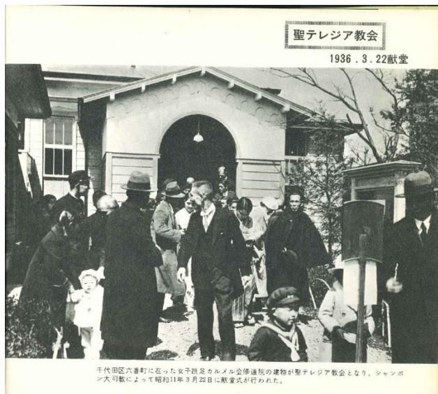
St. Therese Church circa 1936