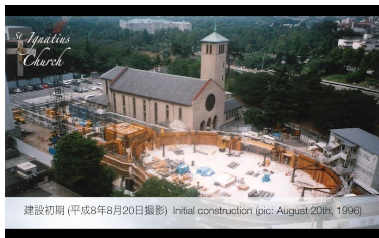
Initial Construction, 1996, of the present Church