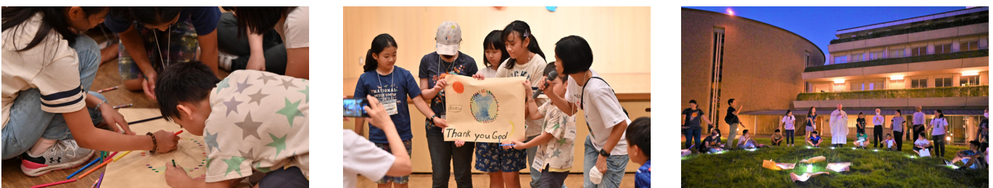
Caption from left to right: 1. Draw where you found God; 2. What to thank God for; 3. Closing Prayer