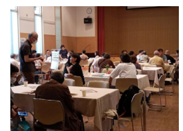
The Sunday Salon Crowd

Do drop by Joseph Hall on a Sunday when there are no reserved functions.