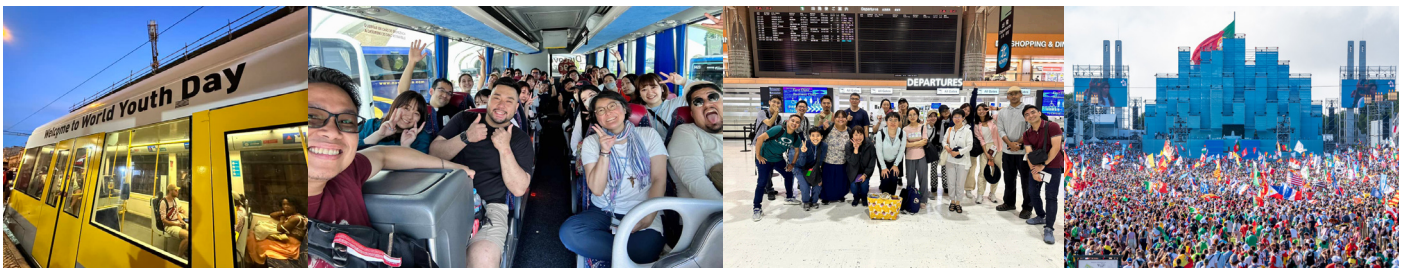
Caption from left to right: 1. "Welcome to World Youth Day!"; 2. Arrival of Japan delegation; 3. MAGIS Departure; 4. WYD Main Stage