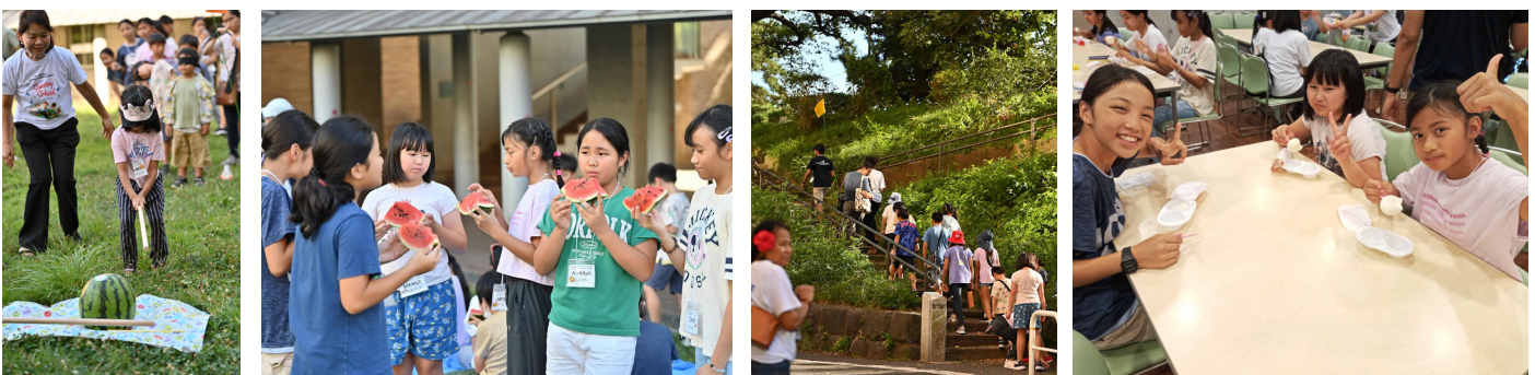
Caption from left to right: 1. Hit it right!; 2. De-li-cious!; 3. Hiking to find God's message...; 4. Ice-cream treat after the hike!