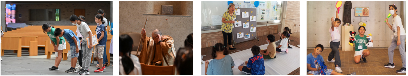
Caption from left to right: 1. Visiting God's House; 2. The Prophet Elijah waiting for God; 3. Creation Booth; 4. Family Booth