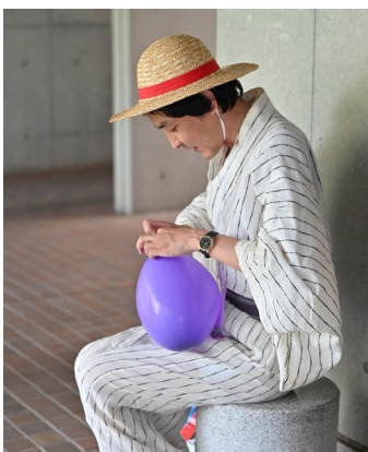
When will I finish...