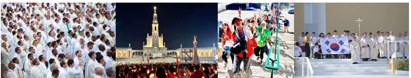
1. Sea of pastors during the Missioning Mass; 2. Santuario de Fatima; 3. Walking for hours and hours; 4. Next WYD announced See you in Seoul! ( https://www.lisboa2023.org/en/article/see-you-in-seoul-in-2027 )