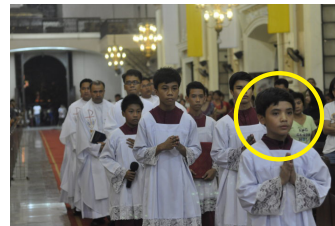
Attending a WYD had always been an aspiration...

Our activities in this experience included Prayers, Celebration of the Eucharist, Eucharistic Adoration, Confession, Sessions/ Reflections, Magis Circle Sharing, and Service at a Home for the Elderly.