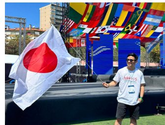
Dream come true!

7/29 (Sat) - last day of Magis Experience. 8:30 breakfast. 9:30 Morning Prayer. 10:30 Magis Circle. 11:20 synthesis, last gathering with large group, giving of some gifts for remembrance. Mass at 12 noon. Lunch at 1 pm. 2 pm clean up/pack up. 3 pm departure from the Retreat House. Arrived in Villa Magis past 4 pm. Welcoming of delegates coming from the different experiences. 8 pm dinner. 9 pm concert. Examen.