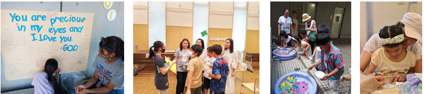
Caption from left to right: 1. Friends Booth; 2. God is in You! Booth; 3. Fishing was fun!; 4. Mother and daughter tandem