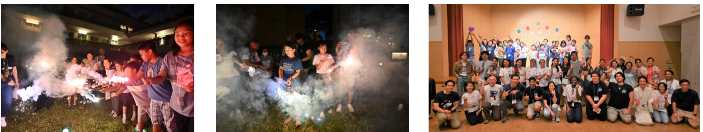
Caption from left to right: 1. Hanabi...; 2. More...!; 3. Thanks for your collaboration!