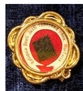
Relic of Takayama Ukon

Soon it will be the turn of the Japanese Community. The organizing community thought of introducing Blessed Justo Takayama Ukon to the foreign community. His relic will be placed on the altar during the Mass and a prayer will be said.